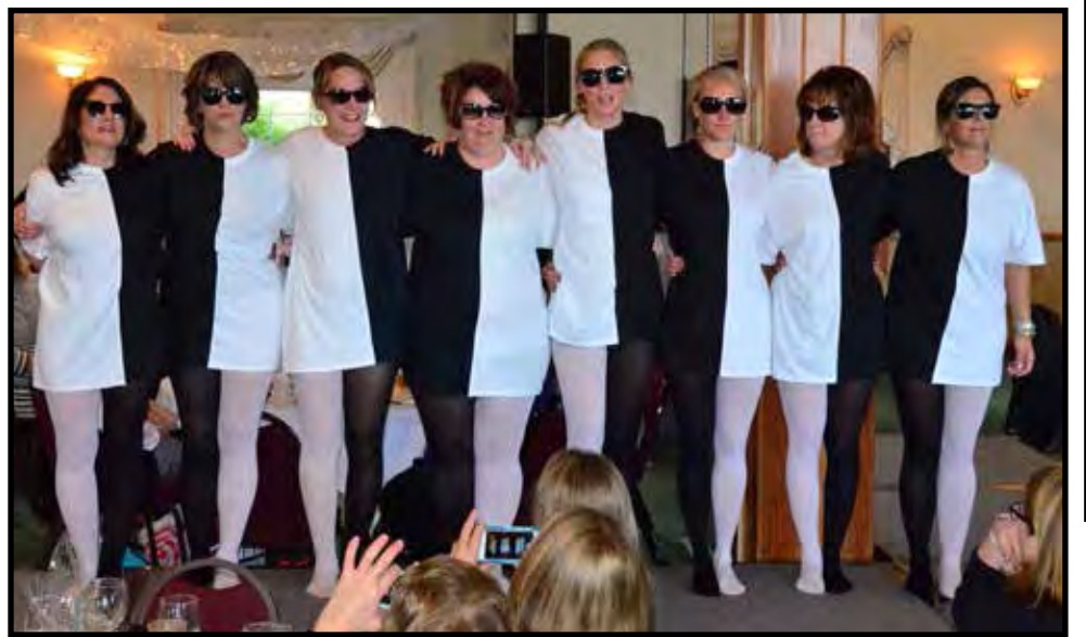
(Below) A dance number was performed by members of the Jordaness Lions club!